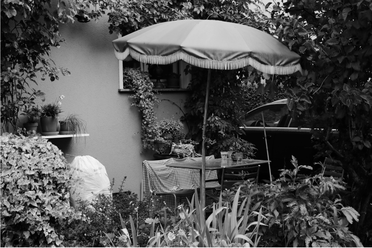
Family garden, Campanellaweg, 10:28