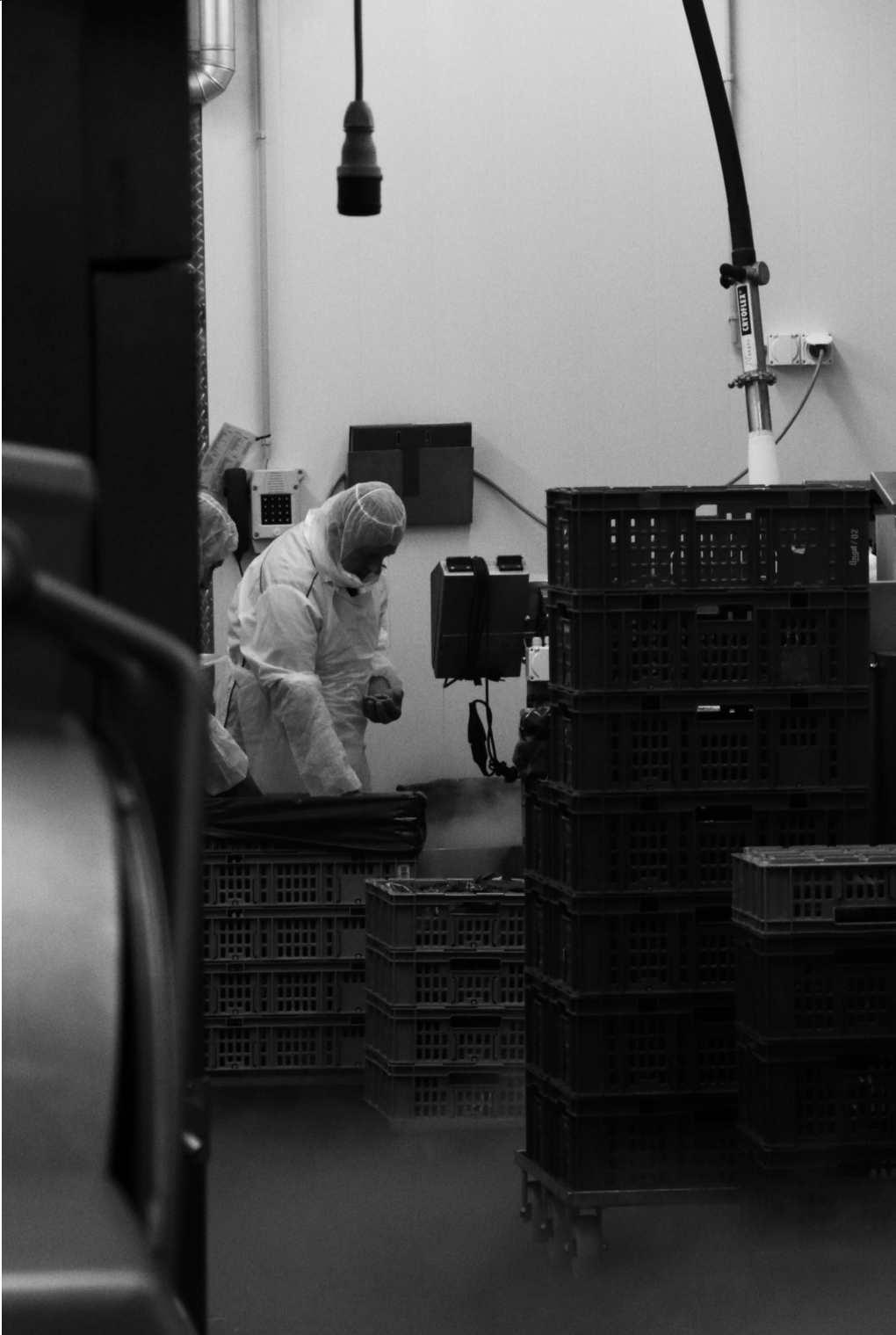
Butcher, Metzgerei Angst, 08:37