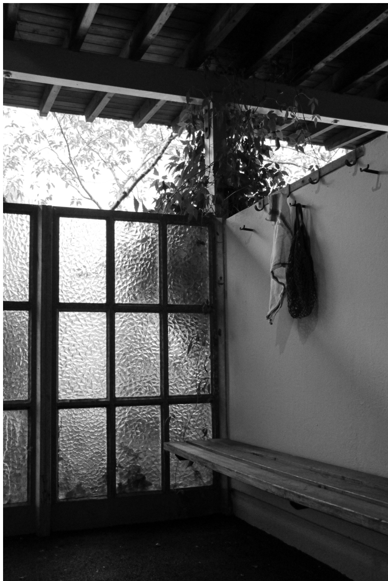
Changing room, Letzibad, 17:04