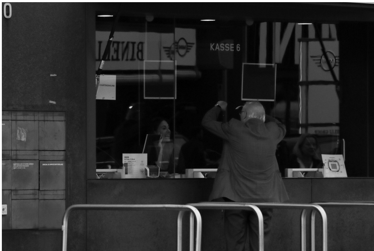
Ticket sale, Letzigrund Stadion, 17:58