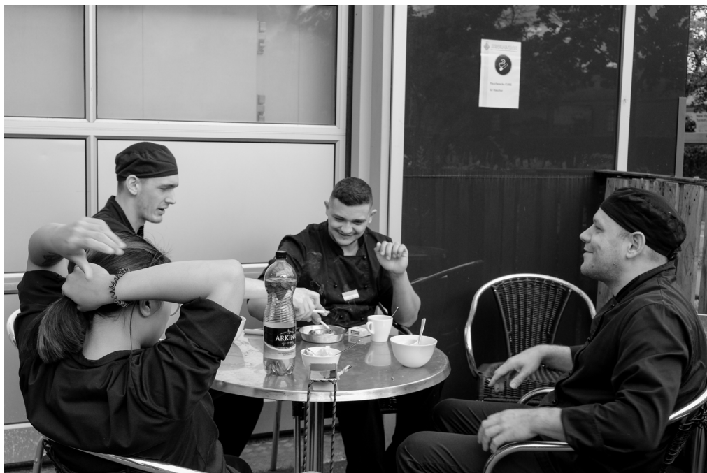
Coffee break, Restaurant Cube, 09:38