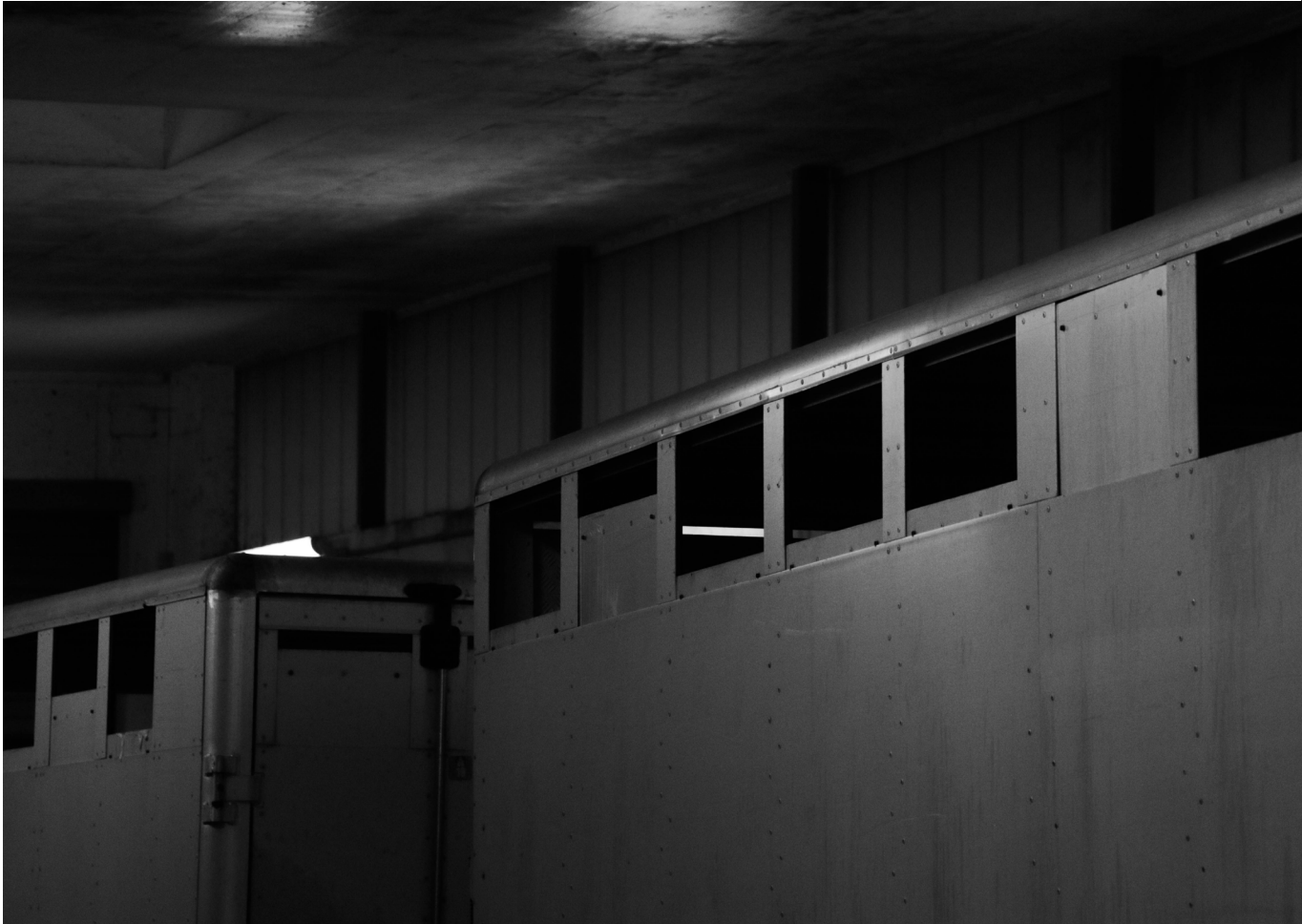
Lorries, Schlachthof, 07:20