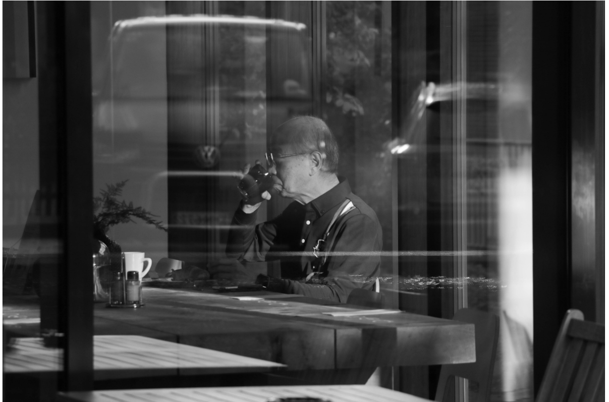
Man drinking tea, Badenerstrasse, 08:00