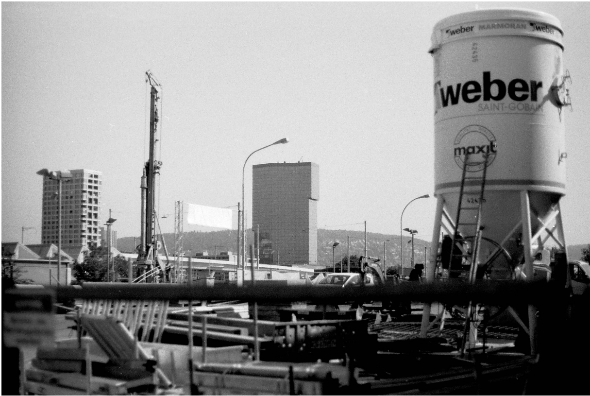
Industrial district, Hardgutstrasse, 12:26