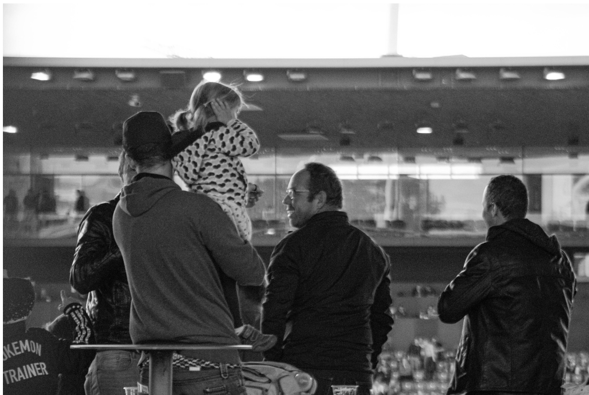
Soccer fans, Letzigrund Stadion, 18:36