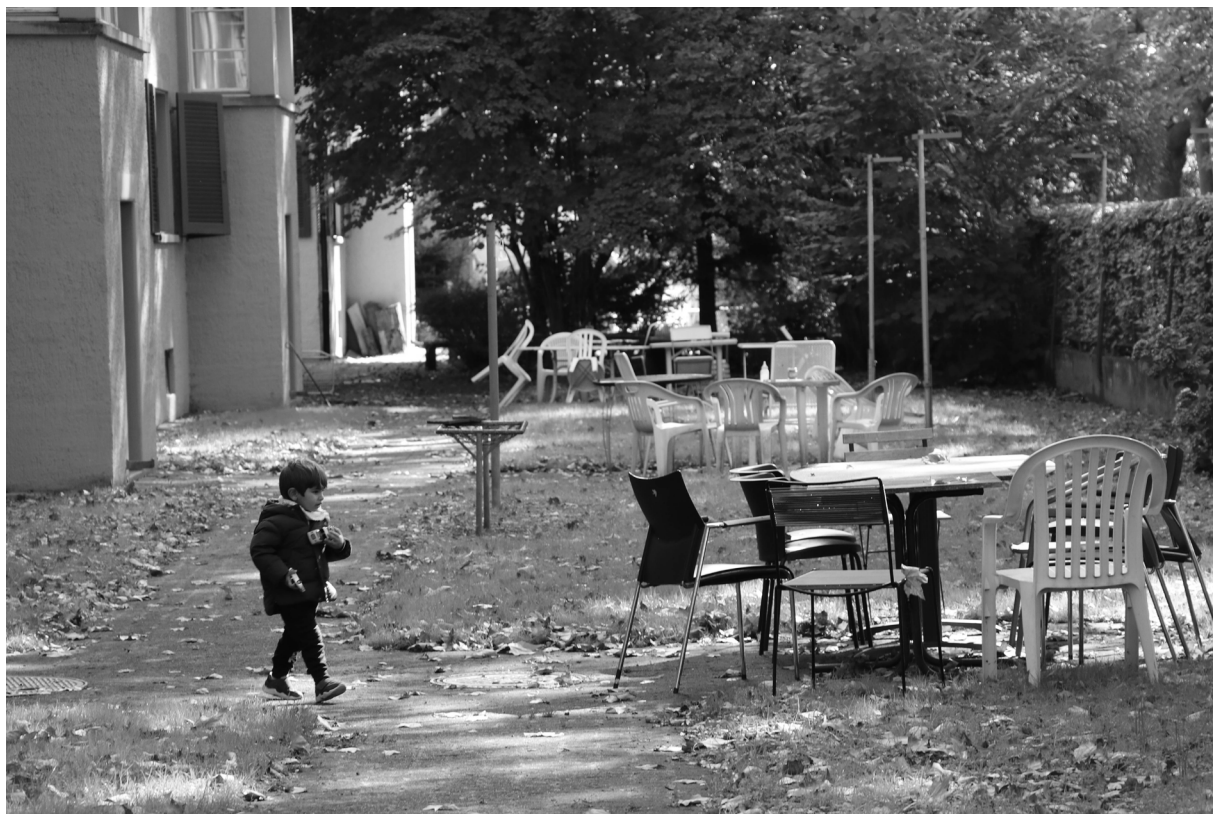
Child playing with toy cars, Bullingerhof, 10:58