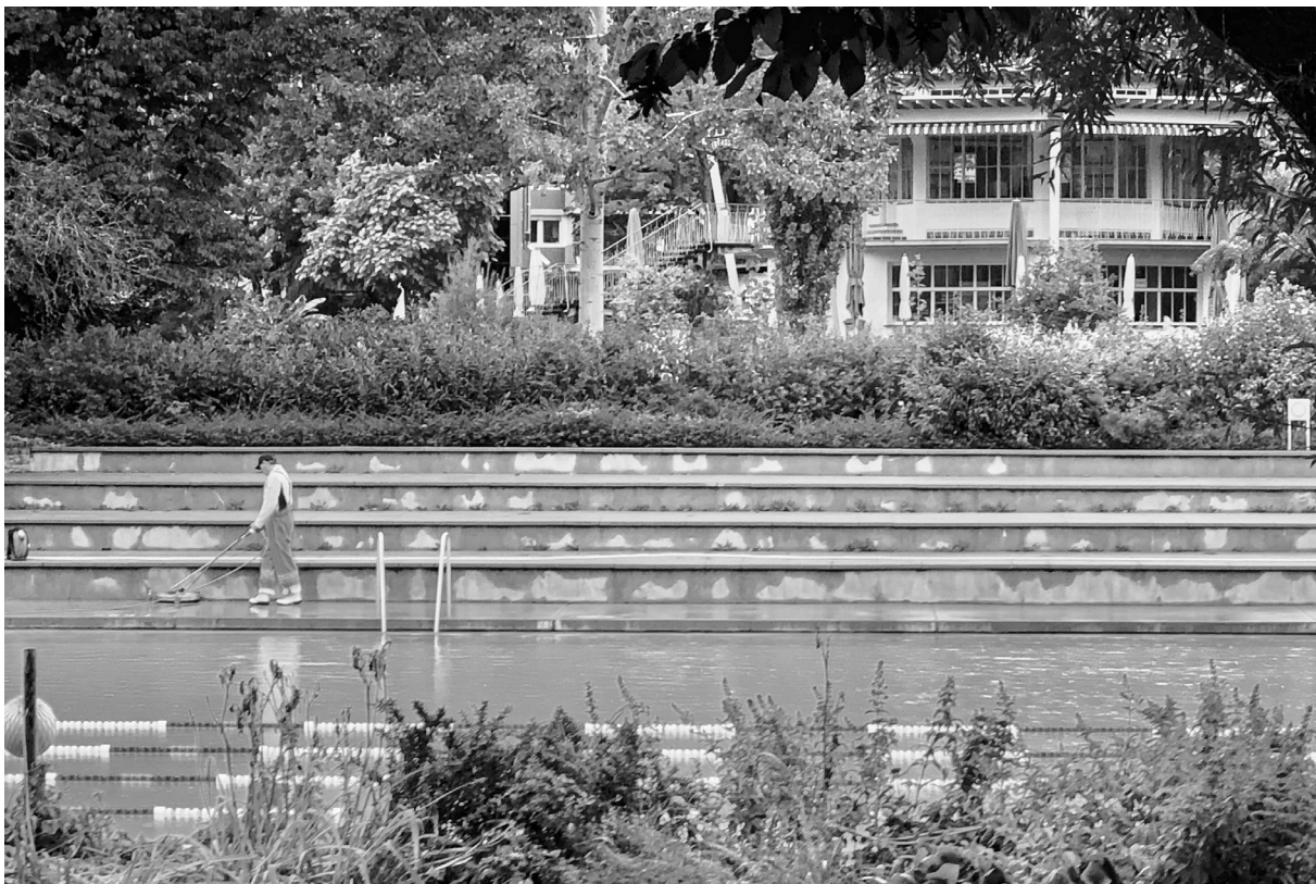
Swimming area, Letzibad, 10:49