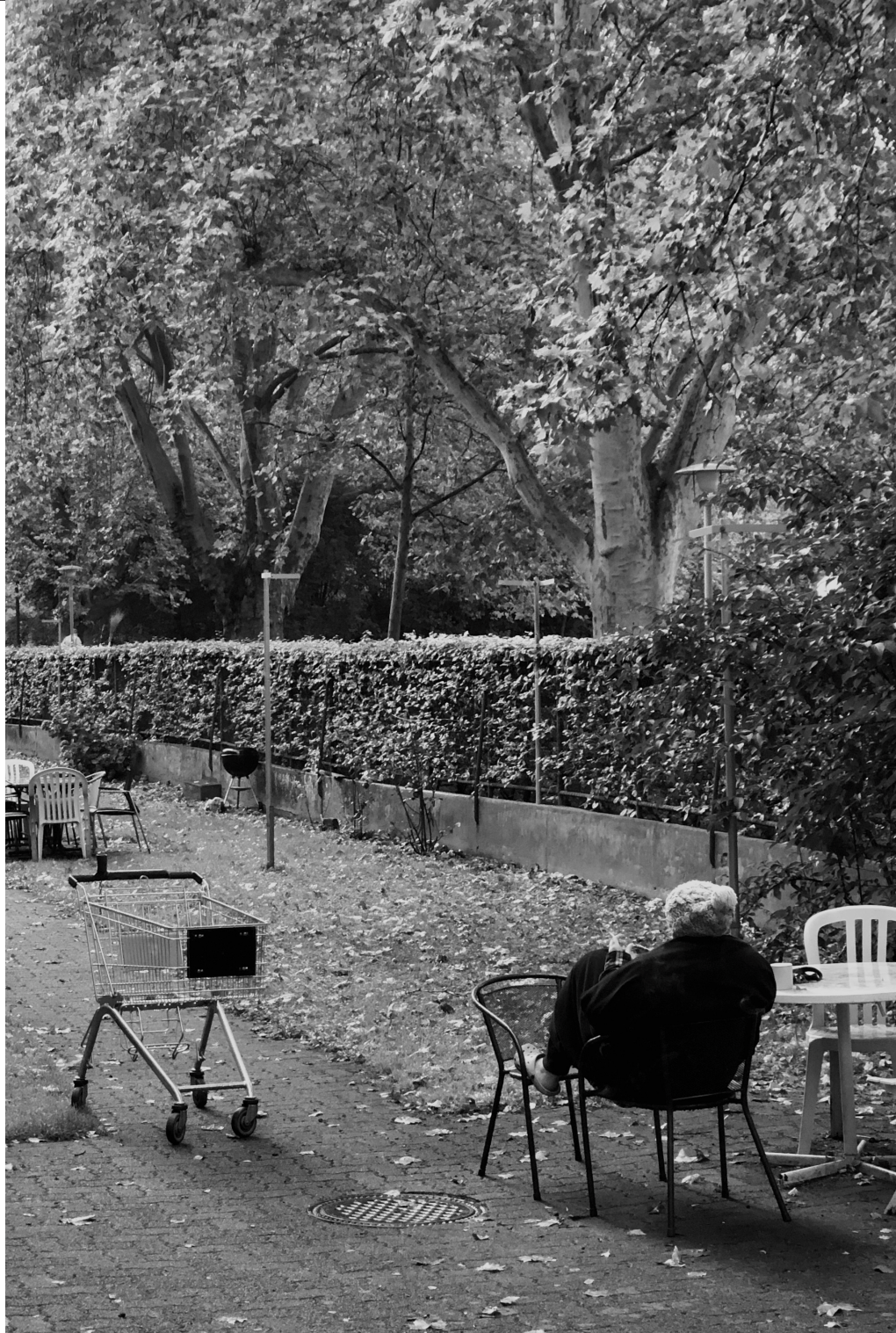
Smoking woman, Bullingerhof, 08:09