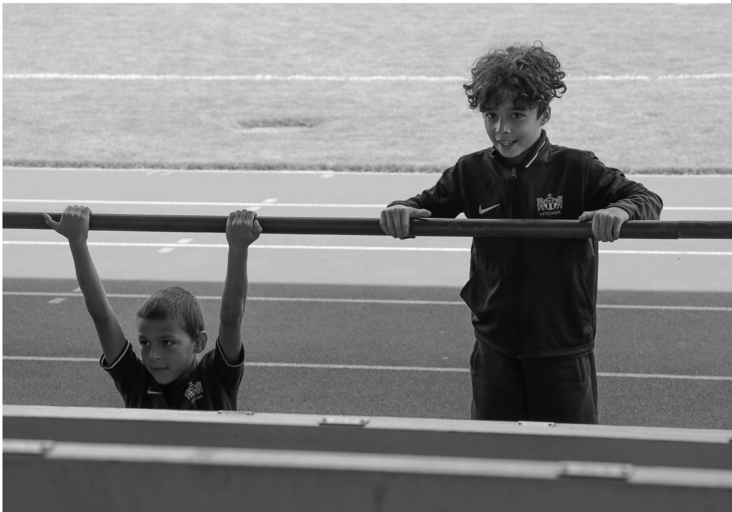
Two Letzikids, Sports track, 14:03