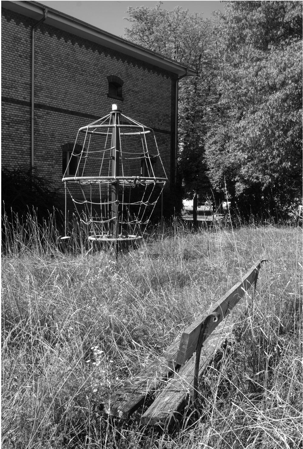
Playground, Herdernstrasse, 12:28