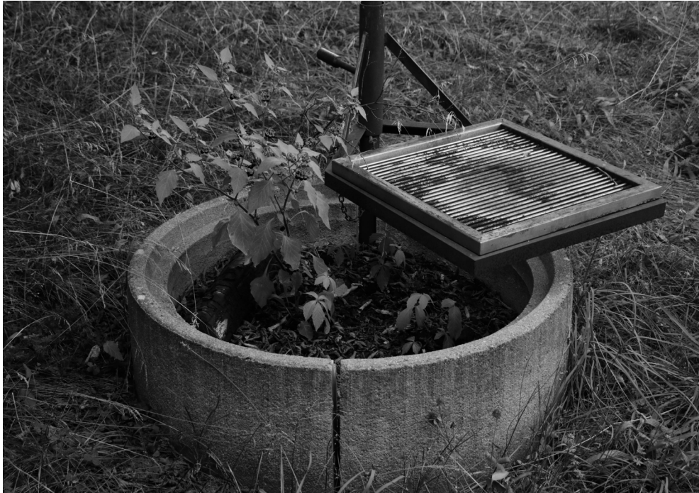
Vegetal fireplace, Herdernstrasse, 14:57