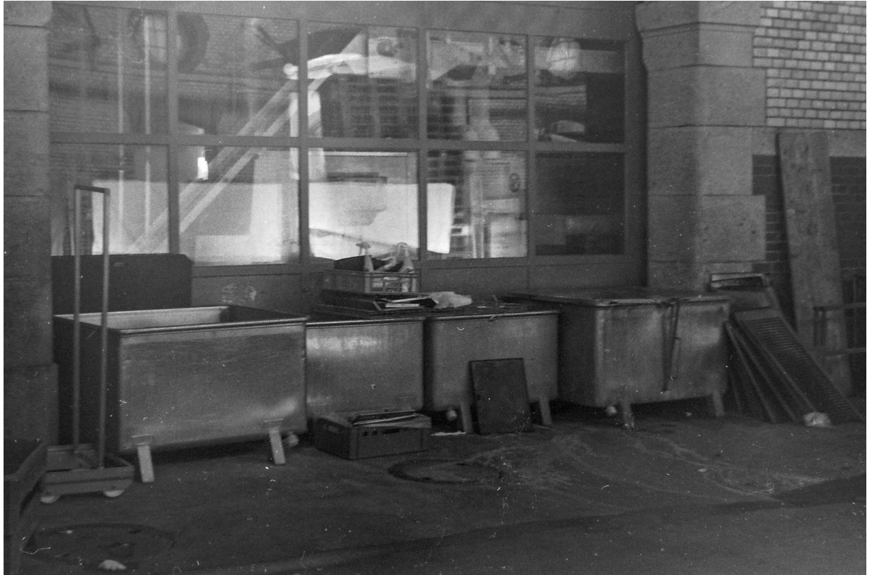
Butchers machines, Schlachthof, 12:26