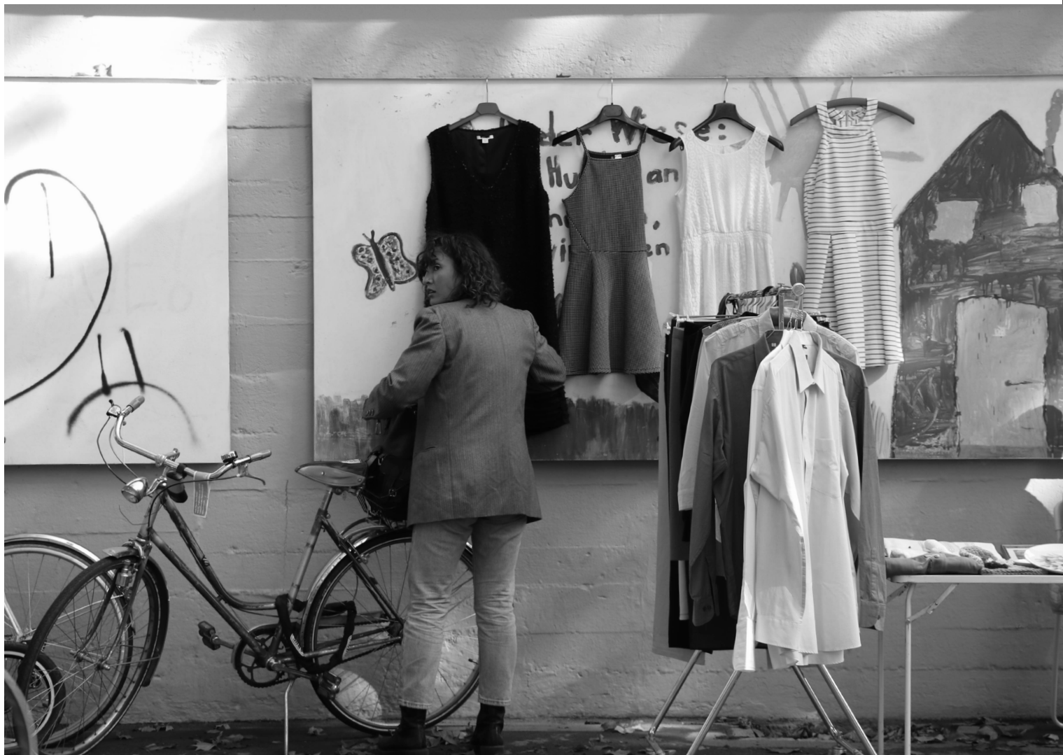
Woman at fleamarket, Bullingerhof, 11:05