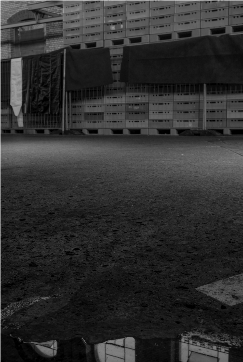
Pallets, Schlachthof, 13:27