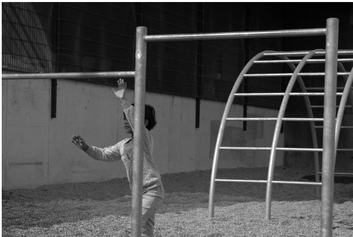
Playing girl, Schulhaus Hardau, 11:30