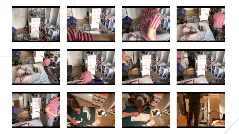
"The whole thing is a collage and I am also caught in it." Michael